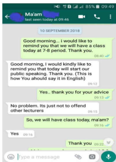
Figure 6. Flouting the maxim of manner

The above picture is the condition from lecturer 6 (see Figure 6) with her student asking information about the class. The respond from the lecturer is considered as flouting the maxim of manner, because in this way, the lecturer did not give a clear and brief respond that she will attend the lecture or not in that day. She replied the student by giving an example of polite reminder toward a lecturer. It could also be seen that the student asked her again by saying 'So, we will have class today, ma'am?' to make sure that she would attend the class or not. This revision from the lecturer also means that this does not need an inference to be understood